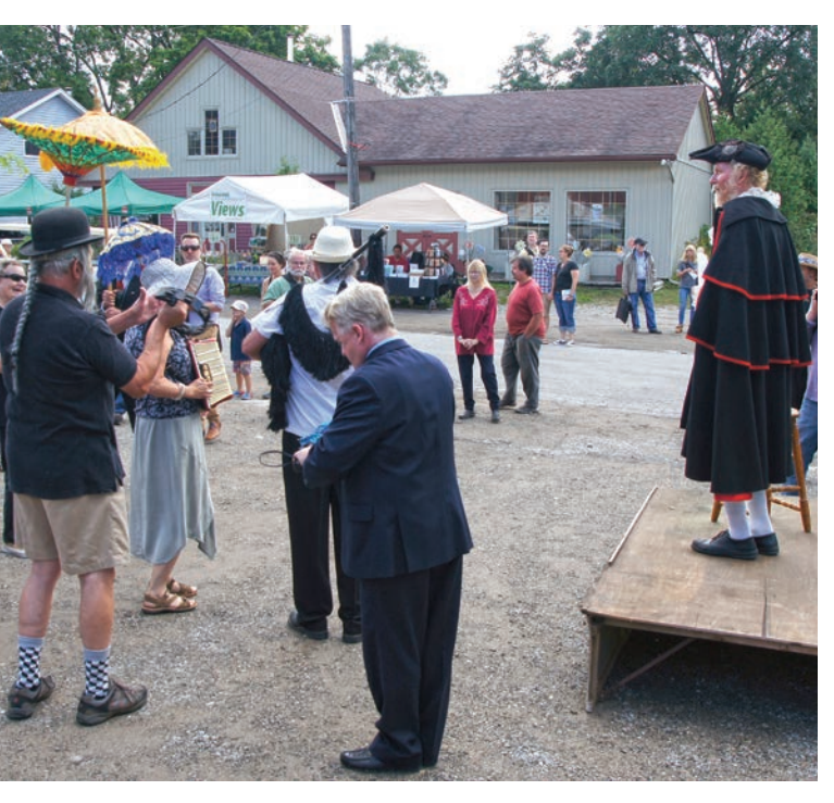
\blacktriangle The Town Crier gave a welcome to Eden Mills Writers' Festival on Sept. 18.