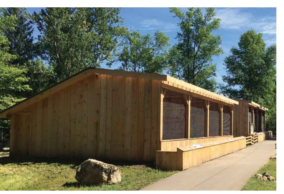
▲ On Sept. 10 Mountsberg Conservation Area in Campbellville hosted the opening of a new barn for its farm animals and a new building of raptor enclosures, shown above.