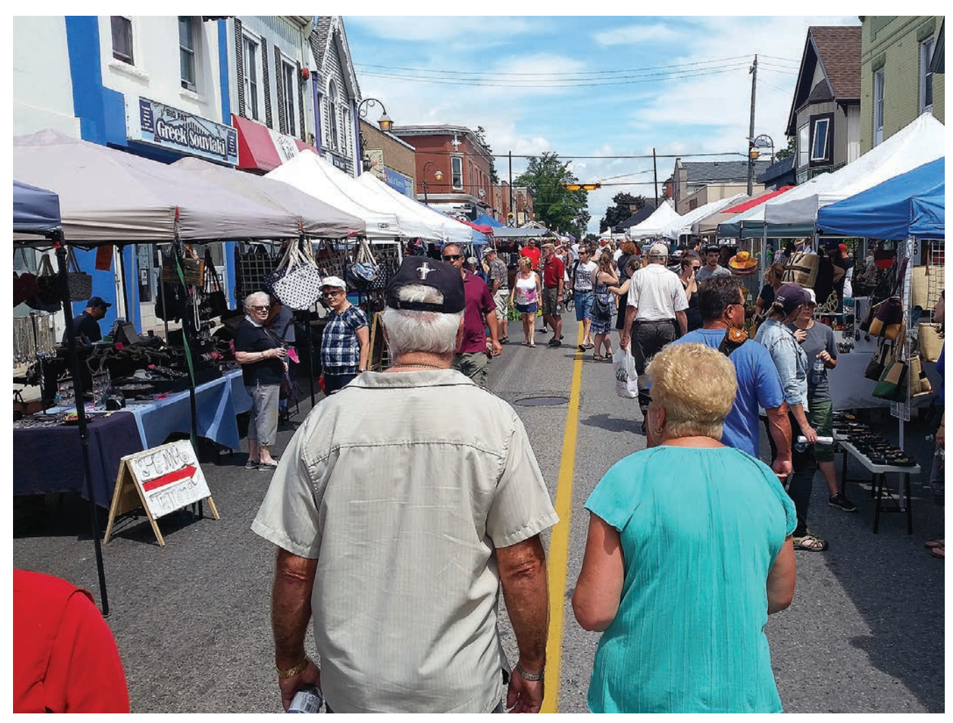
▲ Acton's annual Leathertown Festival was held on Aug. 14.